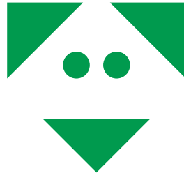
Logo Contest Entry Deadline February 1