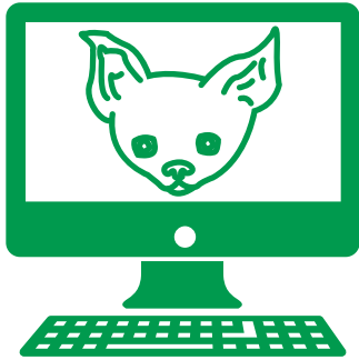
Fall Virtual Event September 11