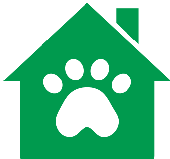
Camp Canine May 13-15