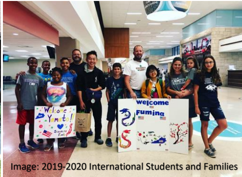
Image: 2019-2020 International Students and Families