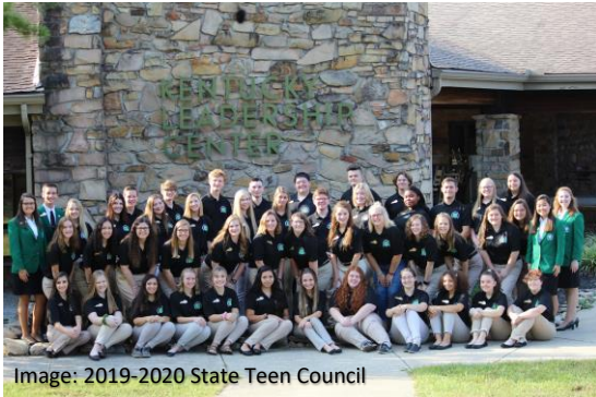
Image: 2019-2020 State Teen Council