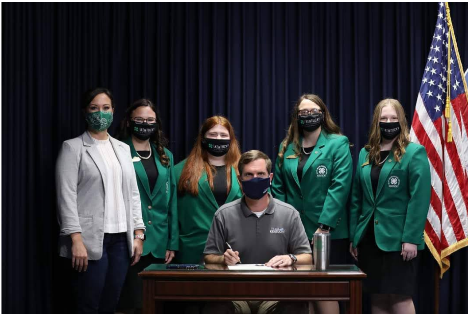
This month, we celebrated National 4-H Week! We were able to meet Governor Andy Beshear to declare this in the state of Kentucky!